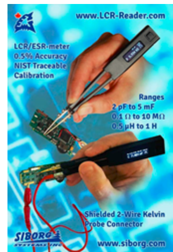
LCR-Reader and the Probe Connector

LED Tester Tweezers with 12 VDC output and adjustable current ratings of 5, 10 and 20 mA. This device combines a set of tweezers to test LEDs and can also test SMT and circuits when connected