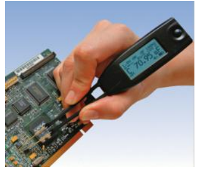
Smart Tweezers LCR-meter simplifies PCB debugging

Light weight and unique mechatronic design of Smart Tweezers make it easily usable by just one hand leaving the other free for for other tasks