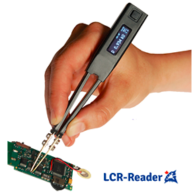
LCR-Reader from Siborg Systems Inc.

We have created both a 4-wire and 2-wire Verification Jigs for calibration of all models of Smart Tweezers as well as the LCR-Reader